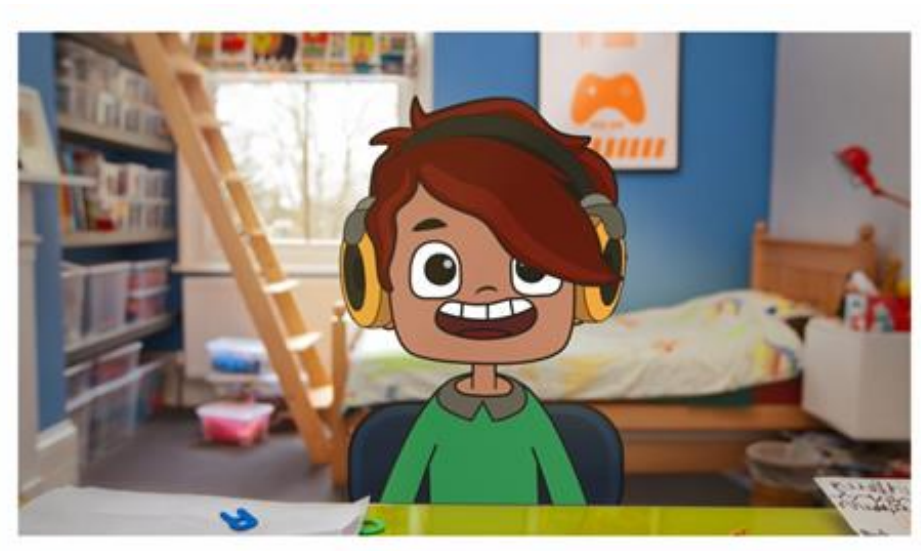
Tips&Tricks to beat the boss